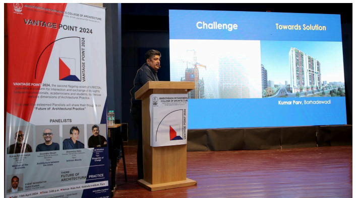
Vantage Point, an interactive seminar for the Fourth and the Final year students, 2023-24