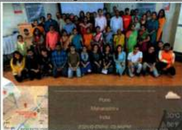
MMCOA staff members and students along with the helpers