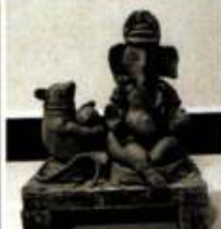
Ganapati Idols done by MMCOA students