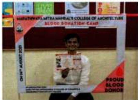
Blood Donor with the Blood Donation Certificate at the camp

to commemorate the death anniversary of Hon. Late Vilasraoji Deshmukh, Ex Chief Minister, Maharashtra State, Former Union Minister, Govt. of India and Ex- President of Marathwada Mitra Mandal. The 'Blood Donation Camp' was organized by Marathwada Mitra Mandal's College of Architecture on Saturday, 14th August 2021. A total of 46 units were collected in the camp. A Certificate of appreciation was given to each donor as a token of gratitude.