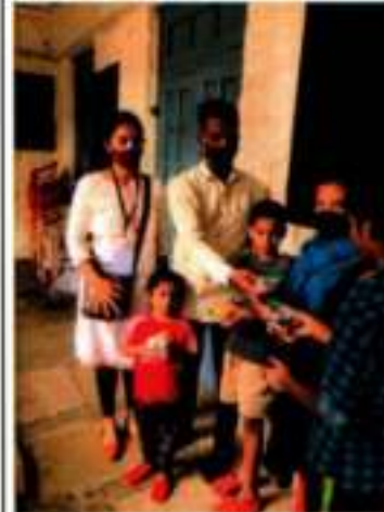
Food Distribution to the children of the NGO