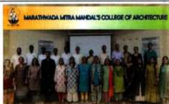
Rashtragaan rendered by staff members of MMCOA