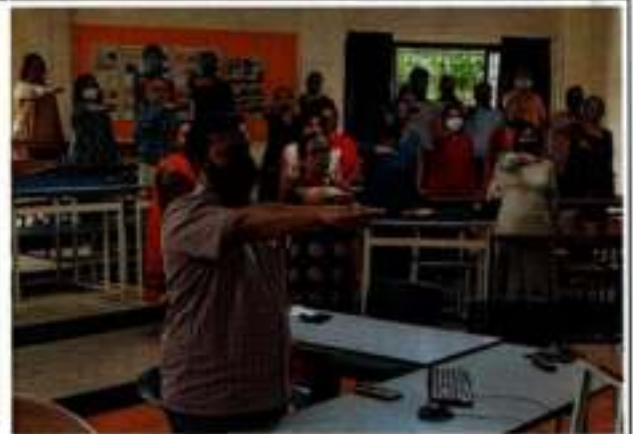
All faculty and staff members taking the 'Sadbhavana Pledge'