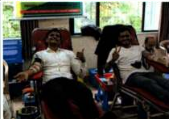
MMCOA students at the Blood Donation Camp