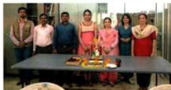
MMCOA staff members worshipping God on 14 th October 2021

Marathwada Mitramandal's College of Architecture, Pune celebrated the Navratri Festival in colorful manner. All staff member were followed the colours for 9 days and showed their interest and joy through different attires. On 14th October 2021, Khandenavmi was celebrated by worshipping the tools used by staff members and also blessed with blessings showered by worshipping God.