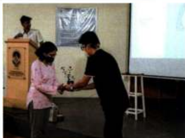
Students felicitating faculty members with a tulsi sapling and their caricature

Students gave various performances for the teaching and non-teaching staff. Students recalled old memories with the faculty members through the audio-visual medium. A tulsi sapling and hand done caricatures of the faculty members were given as a token of appreciation to all.