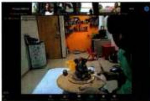
Demonstration for the Idol making - stage 4

Marathwada Mitra Mandal's College of Architecture, organized an online eco-friendly Ganapati idol making workshop. With an aim to protect the environment from the harmful materials used in making idols, the participants were taught to make idols from the shadu mati (an eco-friendly clay) by Artist Devendra Potdukhe.