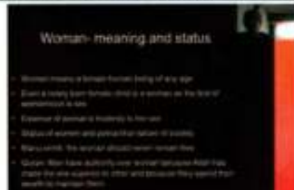
Lecture delivered on woman status and gender equity