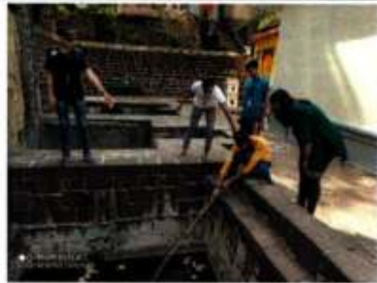
Students carrying out measured drawing on site