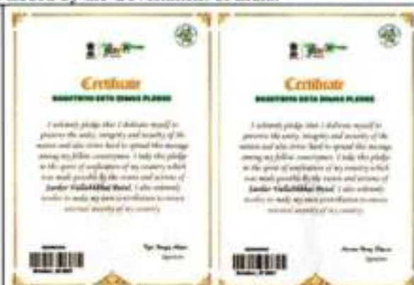
Certificates of students and staff members for active participation