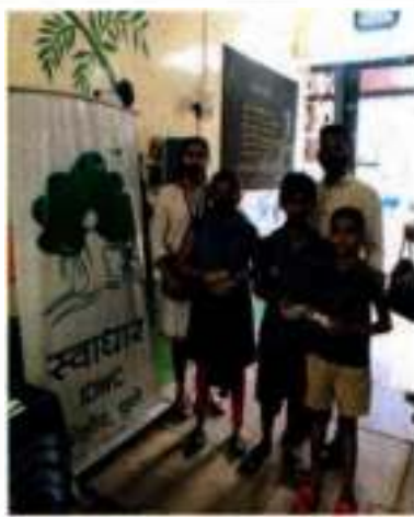
The happy children of the NGO with the food packets