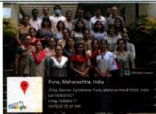
Day 3 (Grey) - 9 th October 2021