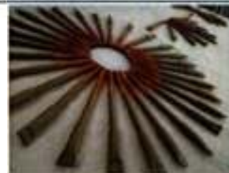
Eco-Friendly Paper Pen for staff members