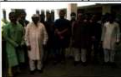
Staff Members in Traditional attire

Marathwada Mitramandal's college of Architecture organized a brunch for all faculty and administrative staff members on Saturday, 30th October 2021 at 10:00 am to celebrate the Diwali festival. Everyone was gifted with Eco-friendly pen made by paper in the support of eco-friendly environment.