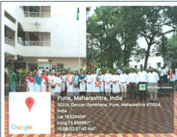
Flag Hosting Ceremony in MMM campus on 15 th August 22

There were activities conducted by MMCOA under the guidelines of Maharashtra Government and SPPU. Under the campaign of 'Azadi ki Amrit Mahotsav', there was an activity from Government of India, to sing and record the National Anthem of India in a group. Students and other staff members of Marathwada Mitramandal's College of Architecture, participated enthusiastically in this activity. Flag Hosting was done in MMM campus on Monday, 15 th August 2022 at 7:30 am, followed by speeches of dignitaries and performances by students.