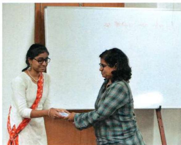
Students felicitating faculty members with a Customized Pen

Students gave various performances for the teaching and non-teaching staff, along with it students have arranged some games for staff members, in which faculty members actively participated. A customized pen with the name engraved on it were given as a token of appreciation to staff members.