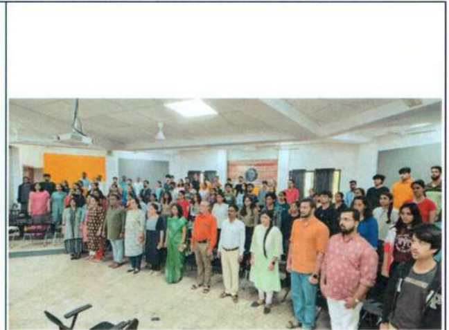
Rashtragaan rendered by staff members of MMCOA