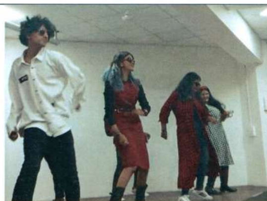
Musical Performance by First year student