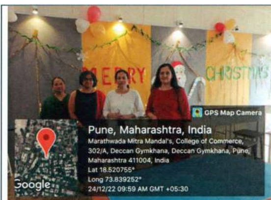
Class decoration by First Year student

The event commenced at MMCOA campus wherein students from all classes showcased their talents and lit the stage with their great enthusiasm. The programme was consist of different arts like dances, singing and play of instruments.