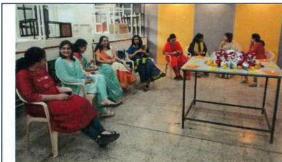
Staff Members enjoying the party

Marathwada Mitramandal's college of Architecture organized a brunch for all faculty and administrative staff members on Friday, 21 st October 2022 at 10:00 am to celebrate the Diwali festival.