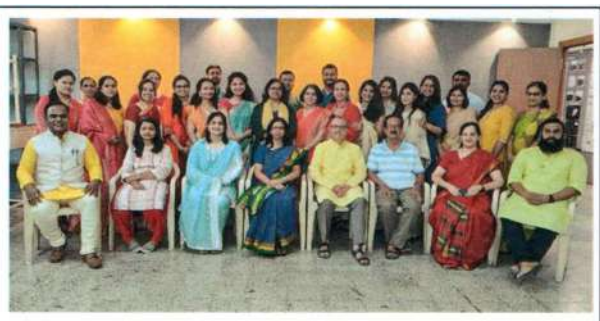
Staff Members in Traditional attire