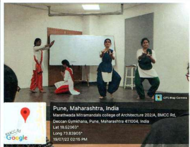
T.Y. B.Arch students performed classical dance as a tribute to the Gurus on Gurupournima event