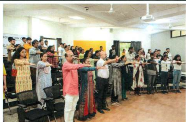
Staff members and students taking the 'Sadbhavana Pledge'