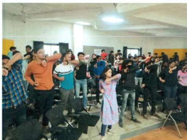
Students participated in the demo lecture of Karate