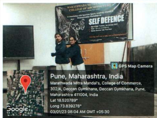
Explained importance of Movement of wrist, elbow and shoulder joint while protecting ourself