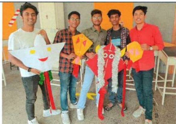
First Year students enthusiastically participated in the event