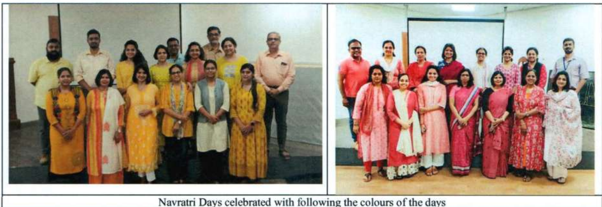
Navratri Days celebrated with following the colours of the days