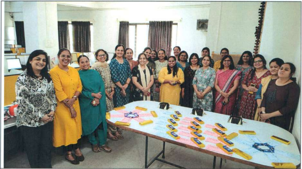
Women staff enjoying the celebration

To appreciate Women staff on "International Women's Day", a small activity as a gesture was organized by Marathwada Mitramandal's College of Architecture, Pune on Wednesday 8 th March 2023.