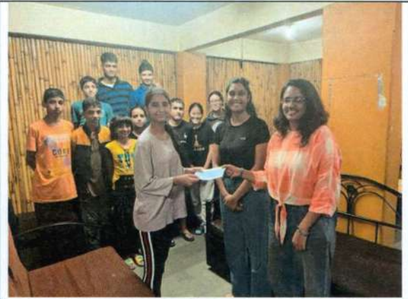
Donation by MMCOA students to the ASEEM foundation