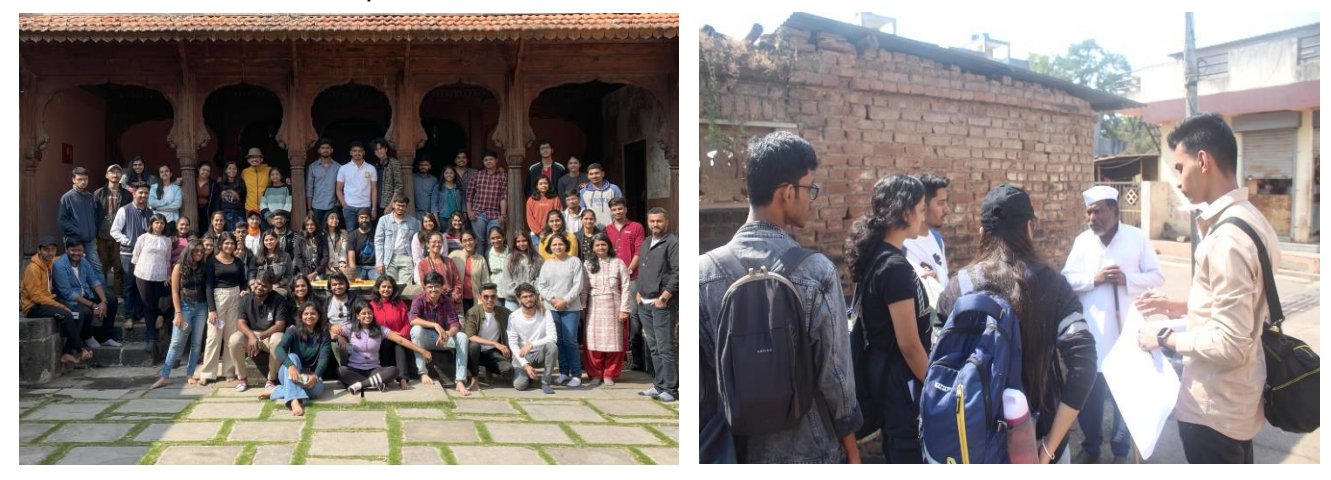
FOURTH YEAR - WAI SETTLEMENT STUDY 2022-23

Nashik vibrant city in northern Maharashtra has developed, established and nurtured a culture and social significance along with intrinsic values of river Godavari and has gained its ethnic conglomeration of socio - culture. The temple architecture in this area became more elaborate with several small and large temples, shrines, thus making a mark of important pilgrimage center. This led to the construction of various Ghats, dharamshalas with typical streets patterns, and settlement along the periphery of the left bank of Godavari. The Ghats were adorned with various sacred pavilions and temples that signified their spiritual and religious qualities. Settlement Study played an integral part in experiential learning and has succeeded to impress the social, cultural and traditional architecture of Nashik. The vernacular and spatial designs and details which are well documented by the students.